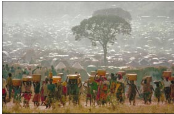
Fig 1 During emergencies, insecticides can be incorporated into plastic tarpaulins