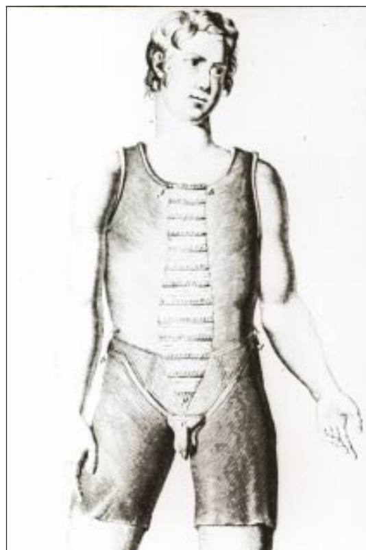
Fig 2 Device to discourage masturbation. From Considération sur les hernies , Paris

medically qualified doctors provided historical accounts of sexual behaviour does not mean, however, that medicalisation had not occurred. If medicalisation is seen as a social process that does not require the active involvement of doctors, and medical science is invoked to support particular ideological positions, then the medicalisation thesis can be sustained regardless of the number of doctors involved.