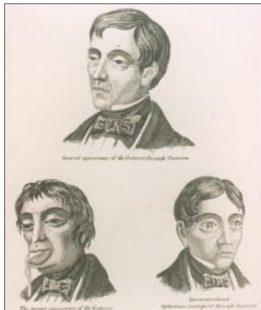
Fig 1 Facial effects of masturbation. From Boyhood's perils and manhood's curse , 1858