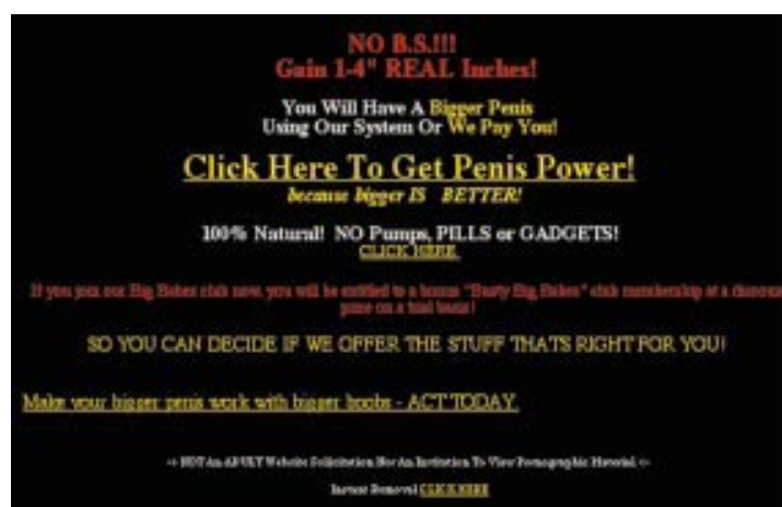
Fig 5 Furthering the “tyranny of genital sexuality”?

The authors of one American report on sexual dysfunction stated that “the strong association between sexual dysfunction and improved quality of life suggests that this problem [sexual dysfunction] warrants recognition as a serious public health concern.” 29 Yet American studies also show that many people's experiences of sexual dysfunction are associated with unsatisfying personal experiences and