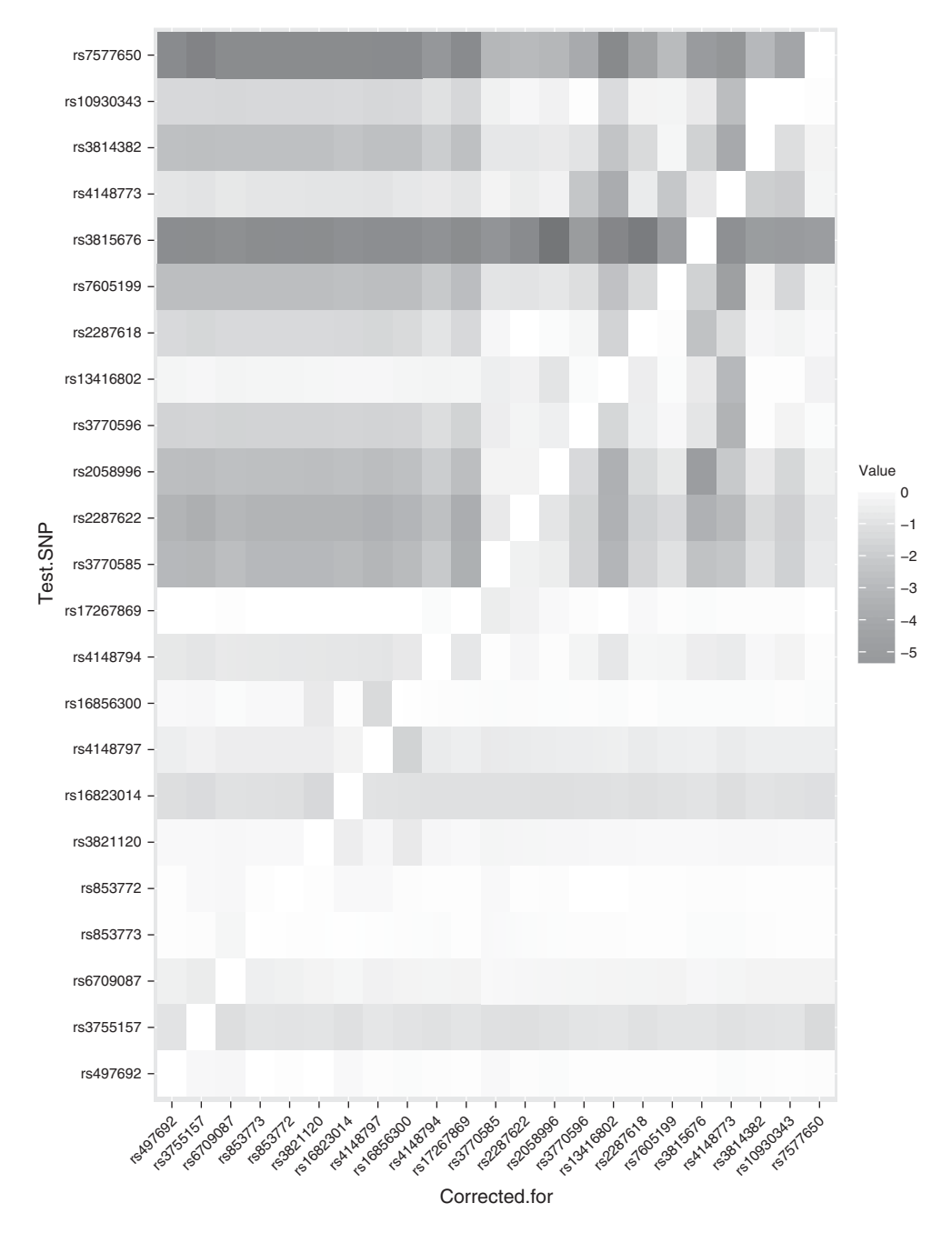
Figure 2. Heat map showing conditional analysis of association signals at ABCB11 locus using the same technique as Figure 1 to identify whether multiple associations are present.

The contribution of synonymous mutations to disease susceptibility via a number of different mechanisms is being increasingly realized (44); however, the possibility remains that this association is because of linkage disequilibrium between rs2109505 and an unknown causative variant.