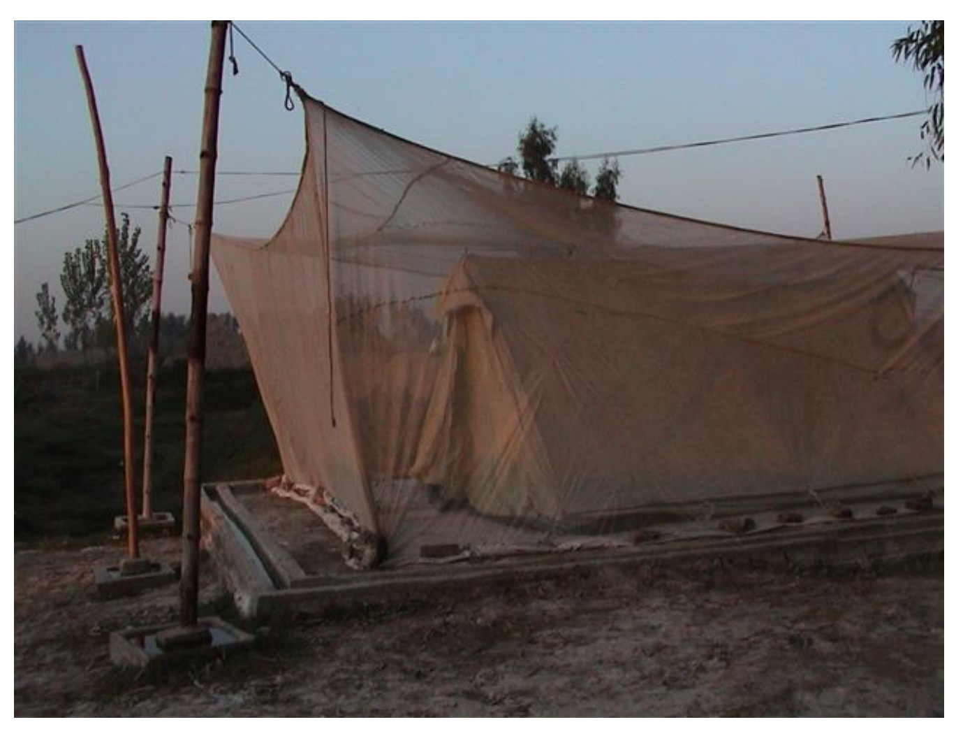
Figure 2 Tent erected in large trap net for overnight platform tests.

mortality. All mosquitoes were categorized as blood-fed or unfed, identified to genus level and the anophelines to species level.