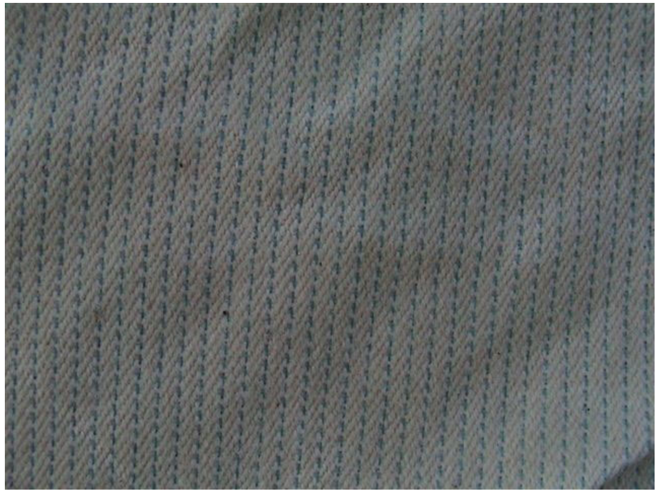
Figure I Close-up of tent material: canvas with delatemethrin-treated polyethelene thread woven through.

stephensi were exposed to the tent under the cones for three or ten minutes, after which they were held under insectary conditions ( 26 +/- 2^{\circ}C and 75 +/- 10% RH) and given access to sugar solution. Knock-down was recorded after one hour and mortality after 24 hours.