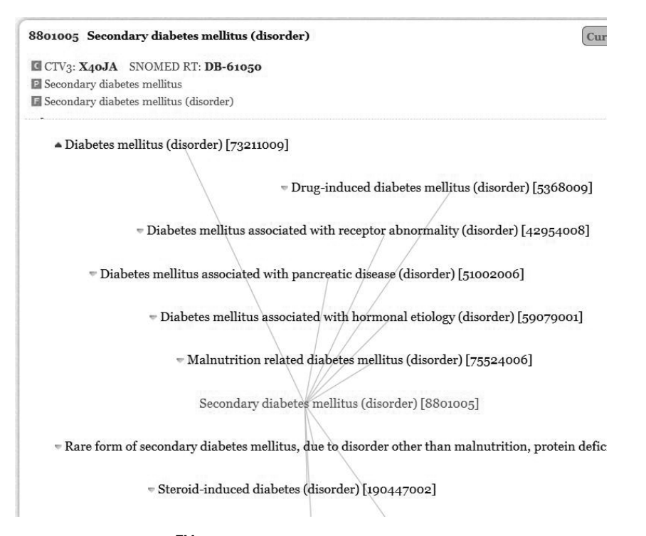
Figure 3 Screen shot of the Snoflake<sup>™</sup> browser showing the relationships with the concept secondary diabetes mellitus (disorder)

of Clinical Chemists (IFCC) units which are expressed as mmol/mol.