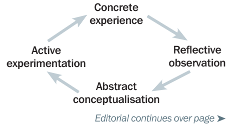
Figure 1. Kolb's learning cycle<sup>3</sup>