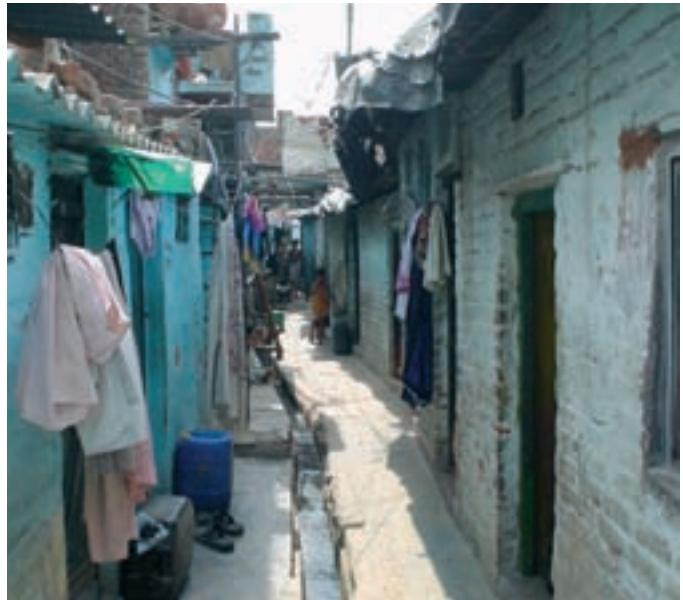
The South Delhi slum where Barry Lester conducted a survey of children who had received spectacles. INDIA

Conclusion: School eye screening in India is a highly cost-effective method of correcting visual impairment due to refractive errors in school-age children and should be expanded where possible. As not all children can be examined through school screening, comprehensive eye care clinics play an important role in the correction of refractive errors, but at a higher cost.