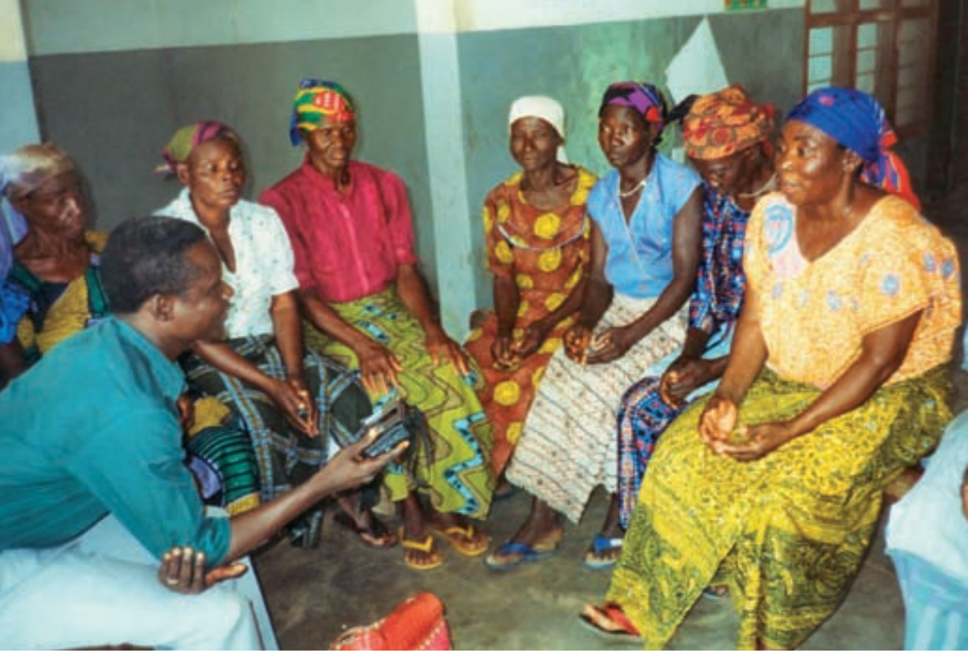
A research assistant runs a focus group discussion on traditional treatments of children's eye conditions. GHANA