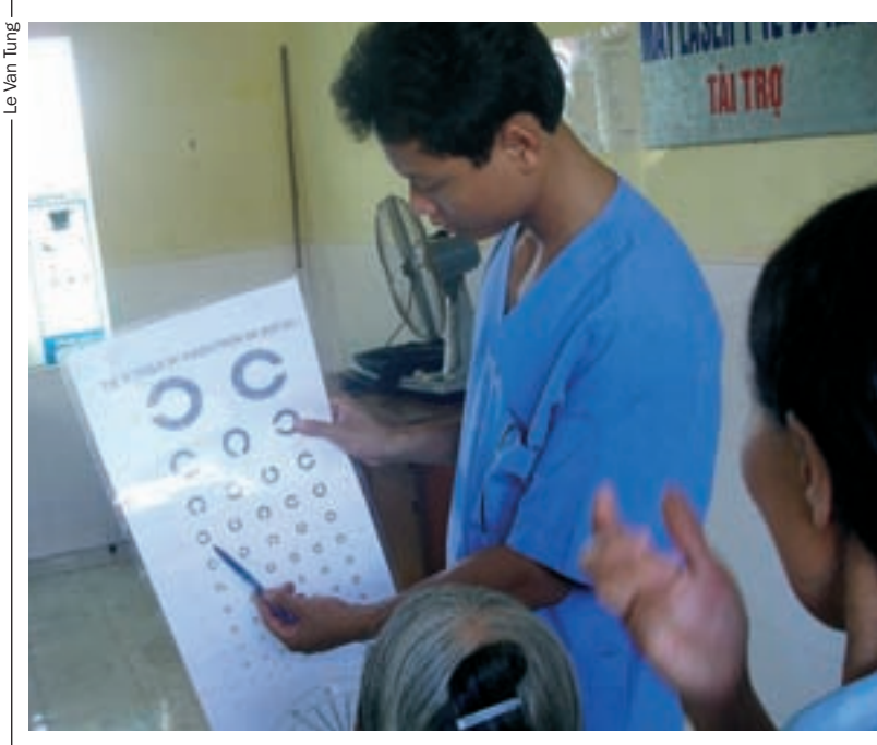
A field worker explains how a visual chart works to a leprosy patient in Van Mon leprosy village, Thai Binh. VIET NAM

Results: A total of 403 patients were seen at the leprosarium. The prevalence of blindness was 9.9% and that of visual impairment, 24.1%. Cataract was the most common cause of blindness (57.5%) and of visual impairment (83.5%). Corneal opacity, from exposure keratitis (15%) and trachoma (12%), was the second most common cause of blindness. Cataract surgical coverage was 42.9%, trichiasis surgical coverage was 50%, and lagophthalmos surgical coverage was only 7.9%. Lack of awareness about treatment was the main reason given for not seeking treatment. Conclusion: The prevalence of visual impairment and blindness in leprosy patients is very high and, at present, patients' eye care needs are not being met. There should be an urgent, comprehensive blindness prevention programme for leprosy patients. There is a need for better collaboration between leprosy control and blindness prevention programmes.