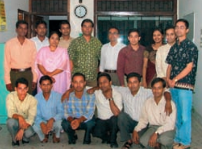
The Child Sight Foundation team. BANGLADESH