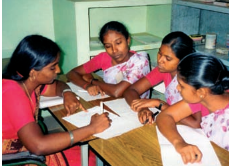
Interviewing hospital-based counsellors about patient needs. INDIA

A literature review should help to give you a context for your planned research. This