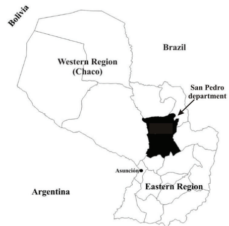
FIGURE 3: Map.

residual spraying (52%, 241/463), treated dog collars (31%, 142/463), and insecticide treated bed nets (28%, 130/463) (Table 4).