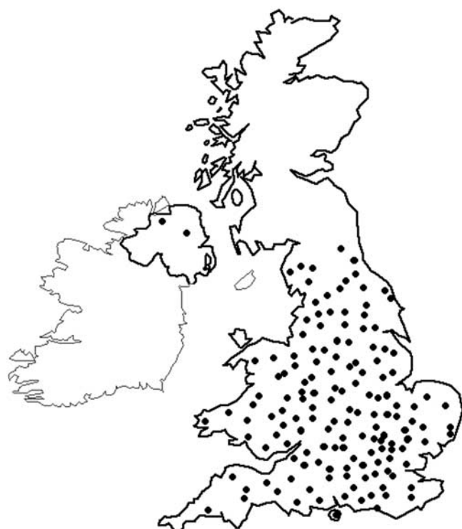
Figure 2 Sites of centres in the United Kingdom recruiting to NSCCG as of March 2007.

To date, blood samples and completed questionnaires have been collected from 8722 cases and 2185 controls. The NSCCG collection will continue until samples from 20 000 CRC cases has been assembled. The number of male patients ascertained or included (59% of cohort) reflects the slight sex preponderance of the disease. In terms of ethnicity, over 90% of patients entered into NSCCG were self reported as White Caucasians. Although controls were of similar age in comparison to cases (mean age 59 years; s.d. = 9.5) and 90% were self-reported as White Caucasians not surprisingly, the majority (64%) were female.