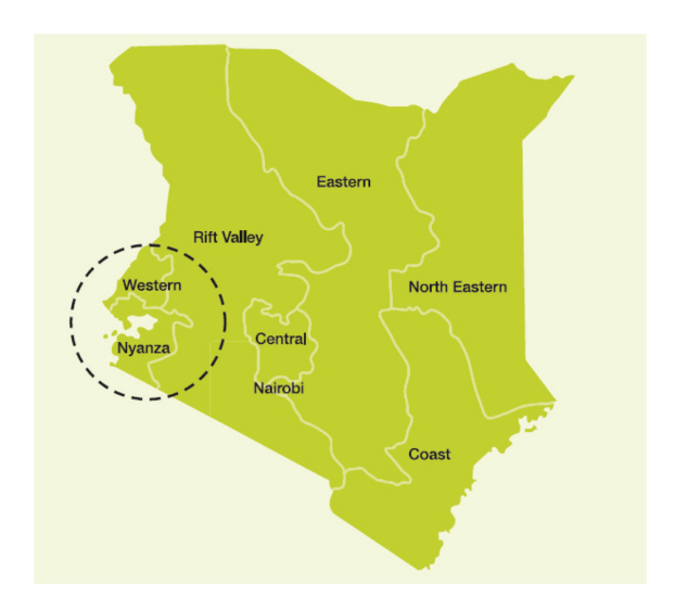
Figure 1 Study setting: Nyanza and Western Provinces, Kenya. Notes: Nyanza Province is a noncircumcising region with a human immunodeficiency virus incidence that is 13% above the national average. Western Province has a large population living in the rural communities.

We recruited males who were 2–60 years of age, capable of signing an informed consent or having a guardian (or parent) willing to sign the document, willing to return for postoperative follow-up visits, willing to undergo physical examination of the penis after circumcision, and capable of answering questions about the male circumcision procedure, sexual activity, and condom use (if applicable). Individuals with known health problems or diseases which might cause adverse events, such as hemophilia and genital ulcer disease,