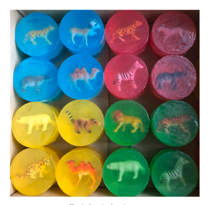
Fig. 1. Surprise Soap image.

The Surprise soap intervention consisted of distribution of Surprise Soap bars within a short (approximately 10-min) household session. Surprise Soaps are round transparent glycerine soaps with toy animals embedded inside (Fig. 1). All soaps were manufactured by the company, KIMA, in Jordan. Brief formative work which involved showing photos of potential toy options and soliciting feedback from IDP camp leaders, hygiene promoters, and adult residents of the camps, was undertaken by Action Against Hunger to ensure the toys were culturally appropriate. On arriving at their designated household, hygiene promoters gathered the children of the household together and initiated a "glitter game" to demonstrate how germs spread: petroleum jelly and glitter were applied to one child's hands who then 'high fived' the other children, transferring the 'glitter germs' between hands. The hygiene promoter then revealed the Surprise Soap bars to the children, explaining that the more often they wash their hands with the soap, the faster they will reach the