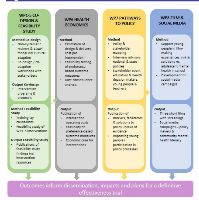
Figure 1 Study work packages (WP).

and coadaptation of interventions via WP1-5. Years 2 and 3 will include a feasibility study of the adapted interventions alongside WP6 and 7. WP8 will run across all 3 years.