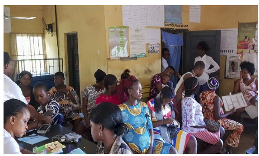
A busy antenatal clinic in a health centre provides an opportunity for eye health promotion amongst pregnant women. NIGERIA

The National Health Policy (2016) advocates integrating eye care services into existing national health programmes, including PHC, while the National Eye