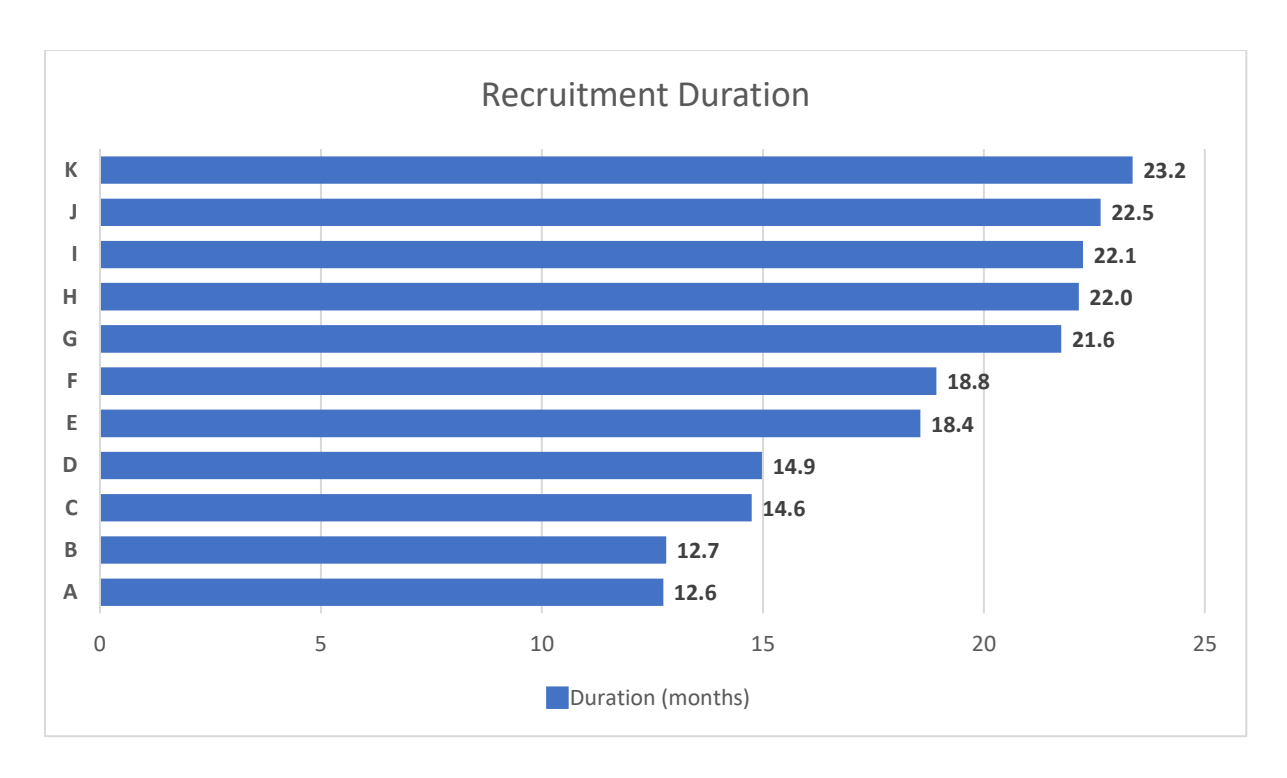
Supplement Figure 1

Duration of screening period for 11 cardiac units in the UK during the time course of the CAVIAR study