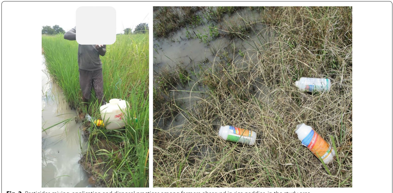
Fig. 2 Pesticides mixing, application and disposal practices among farmers observed in rice paddies, in the study area

amine salt) were commonly used during weeding to control soft weeds in rice farms: