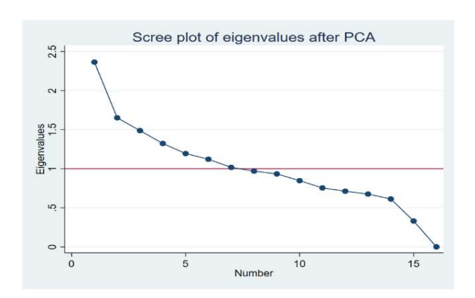
Figure 2. Scree plot of eigenvalues after Principal Components Method (PCA).

We used the Scree plot (Figure 2) and the eigenvalues >1 of the principal components to decide the number of factors to retain. We retained the factors with loadings showing an absolute value \geq 0.3. We used these loadings to define the food groups that characterized each dietary pattern.