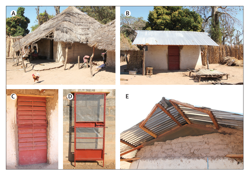
Figure 2: Study houses

Unmodified, thatched-roofed house (A), modified, ventilated screened house with metal roof (B), fixed-louvered front door with mosquito screening behind the door (C), screened back door (D), and ventilated screened window in each gable end (E).