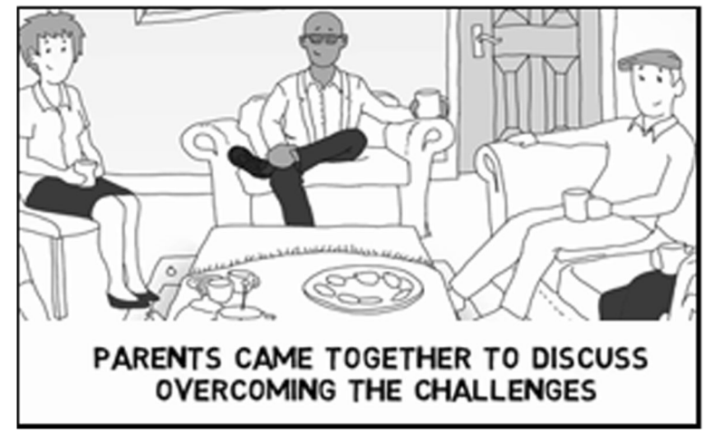
Fig. 2 Instructional Feature Screenshot

The intervention was delivered to approximately 4097 students (48% male) in the 33 intervention group schools by 175 teachers. A link to a short online survey relating to perceptions of the programme was texted or emailed by schools to the primary parent/carer contact of participating students (n = approximately 4097) and 3% of these were returned (n = 134, 2 male). Parent participants for the semi-structured interviews (n = 10, 1male) were recruited via requests for volunteers from case study schools and respondents to the online survey. In the eight case study schools, teachers who delivered the programme (8 groups, n = 31) and adolescents (8 groups, n = 58) volunteered to take part in focus group discussions. In all intervention schools (n = 33), 3179 adolescents (47% male) completed a short student programme engagement and satisfaction questionnaire when implementation was complete. Other data sources