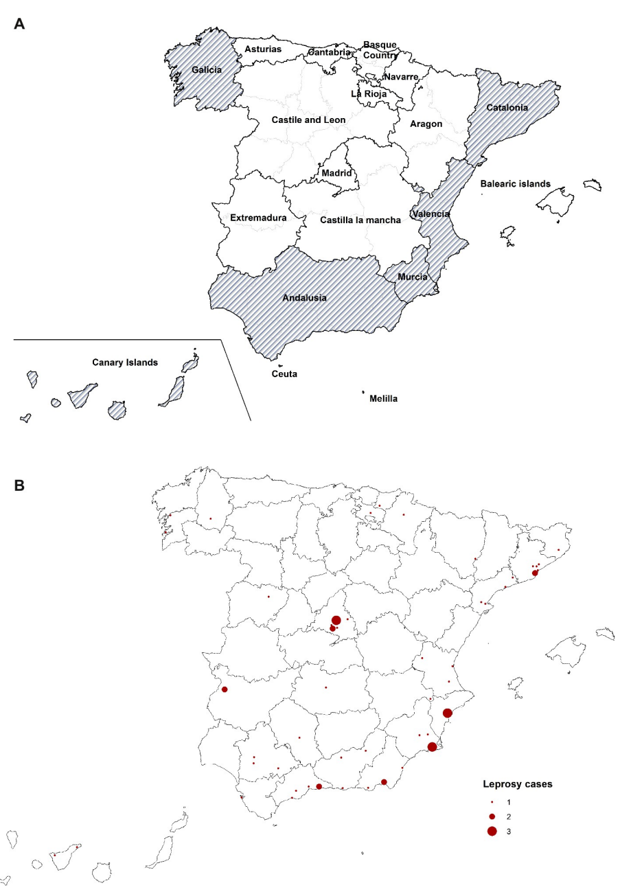
Fig 1. A: Spanish autonomous regions and historical leprosy endemic regions B: Recorded location of residence of autochthonous cases, 2003–2018. (A) Historical leprosy endemic regions are shown with diagonal shading. Division of provinces within each autonomous region is shown with light grey lines. (B) Village of residence (but not province of residence) was unknown for 7 cases resident in the provinces of Alicante (2 cases), Badajoz, Cádiz, Madrid, Murcia and Santa Cruz de Tenerife (1 case in each); these patients have been placed in the capital cities of each of their provinces in Fig 1B.

https://doi.org/10.1371/journal.pntd.0008611.g001