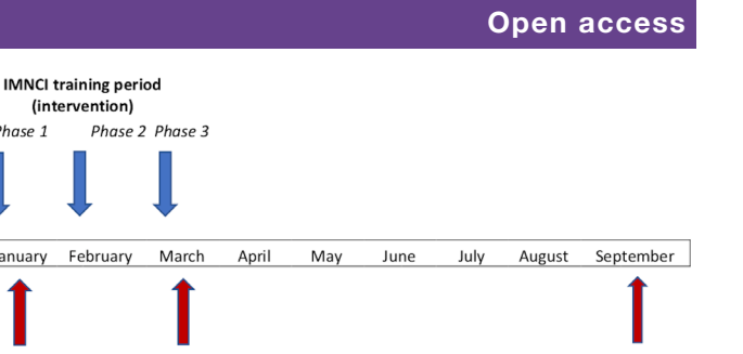
6 months Before After after trainina trainina training testing testing testing Study period Figure 2 Study and intervention timeline 2018. IMNCI,

A semistructured topic guide with open-ended questions was developed for face-to-face interviews to seek