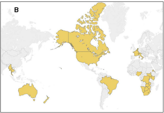
Figure 1 (A) Countries with HIV testing services policies identified and included in analysis (n=91). (B) Countries with policies identified containing information on HIV testing in the context of pre-exposure prophylaxis (n=27).