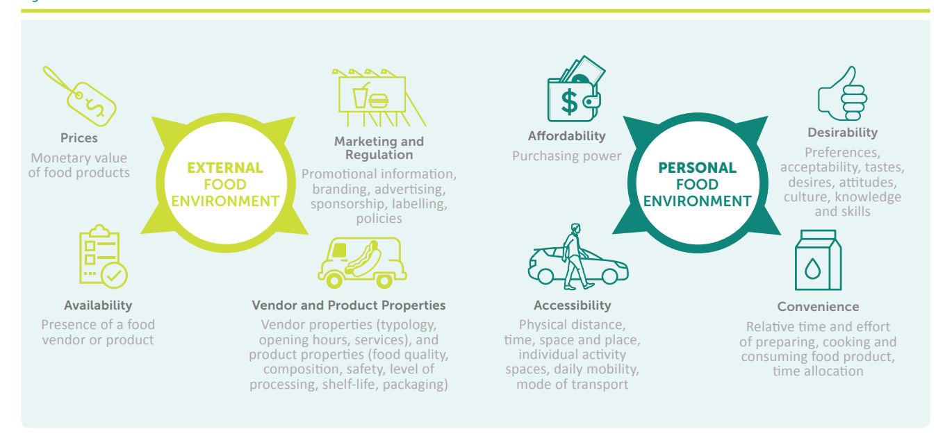
Figure 2: Food environment domains and dimensions

The third advantage is that the delineation between the external and the personal domains makes a clear distinction between the exogenous and endogenous dimensions. Although inextricably linked, the articulation of these domains and dimensions within the food environment construct helps to distinguish and disentangle the multiple interlinked pathways that drive food acquisition so that targeted interventions may be tailored to the specific needs of a given setting.