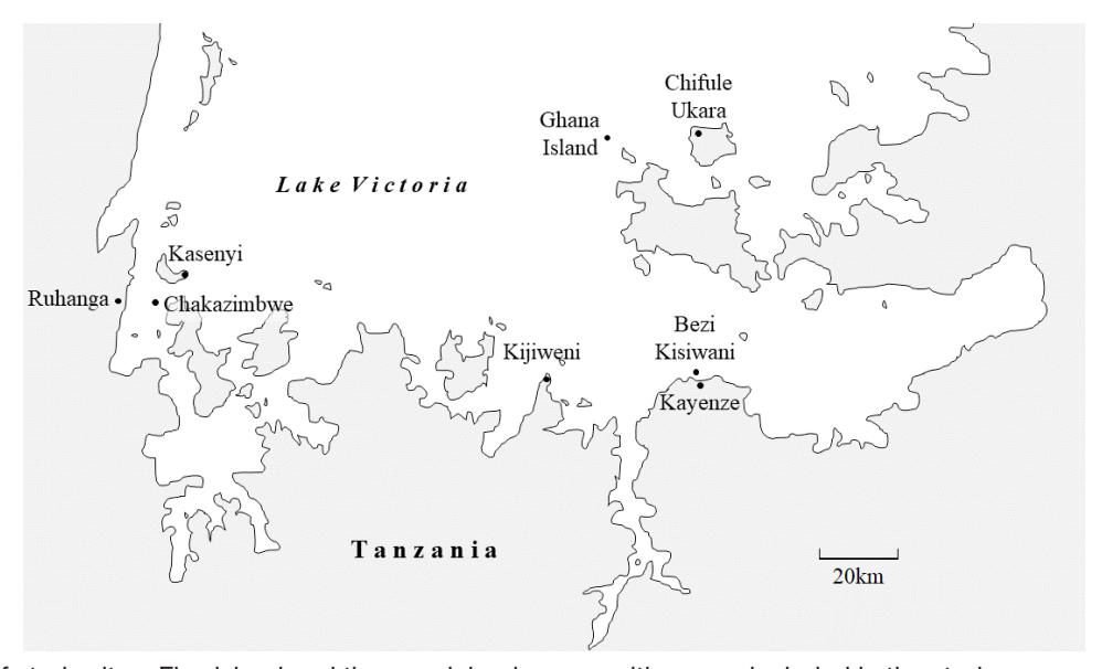
Figure 1 Map of study sites. Five island and three mainland communities were included in the study.

Our study was conducted in five island and three mainland fishing communities around the Tanzanian shoreline of Lake Victoria (figure 1). Of the estimated three million people living in Lake Victoria fishing communities, <sup>12</sup> approximately 60% are thought to reside within Tanzania. The fishing industry provides a major source of income for these communities, with men filling roles as boat builders, boat owners, crew and in fisheries management, and women processing and trading fish. Lake Victoria fishing communities are typically poor and have high rates of illiteracy. 14 Many have limited availability of services such as schools (particularly post primary education) and health facilities. Housing largely comprises temporary or semi-permanent structures, and often has no electricity supply; frequently, the lake is a household's main source of water. Land-based transport is typically on dirt roads, often by bicycle or motorbike; most community members do not own cars. Many lakeside fishing communities have a high prevalence of HIV/AIDS, <sup>14</sup> and other common health threats include malaria, bilharzia, tuberculosis, syphilis, typhoid and cholera.