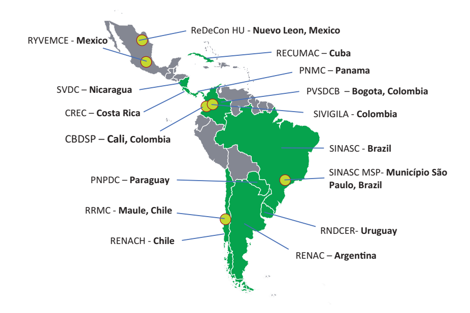
Figure 2. Birth defect surveillance network (RELAMC).