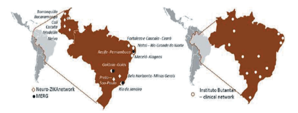
Figure 1. Microcephaly Epidemic Research Group (MERG), Neuro-Zika, and the clinical sites of the Butantan Phase 3 trial for dengue vaccine.