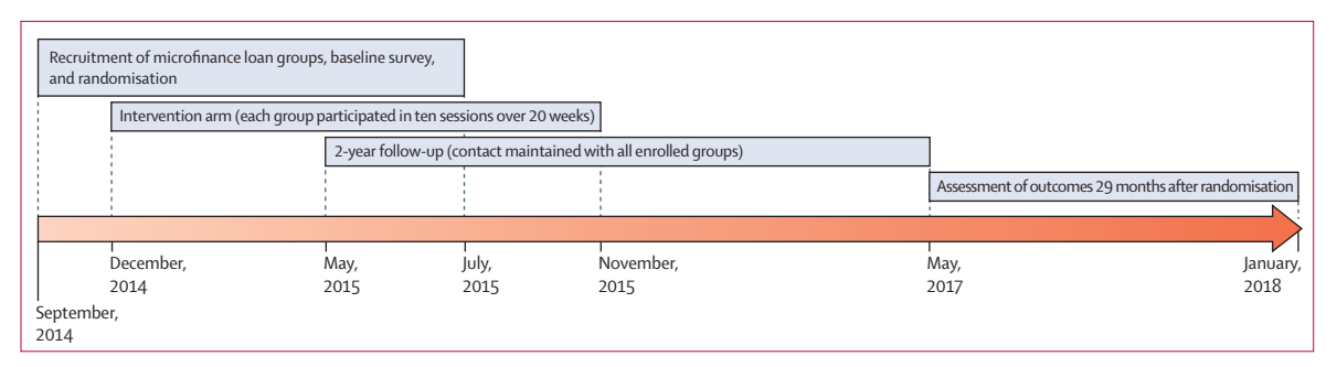
Figure 1: MAISHA trial timeline

The trial was done following WHO guidance on researching violence against women. During the trial, participants were provided with information about local support services for women experiencing relationship difficulties, including violence. Women who requested help were supported by the trial team to access local services.