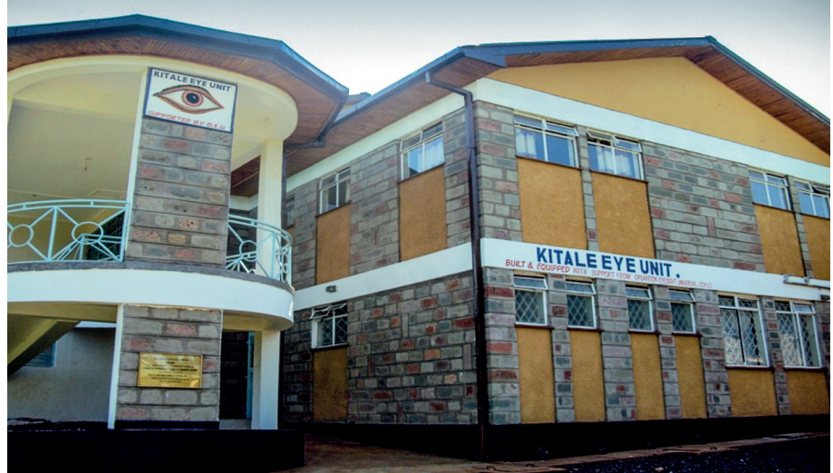
Kitale eye unit was built and equipped with support from Operation Eyesight Universal.

The people are the most important asset in any organisation. Eye care workers are scarce and expensive to recruit. Various methods have been used to utilise available staff optimally, for example training, motivation, target setting, and task shifting. These will be discussed in more detail in a future issue of the Community Eye Health Journal .