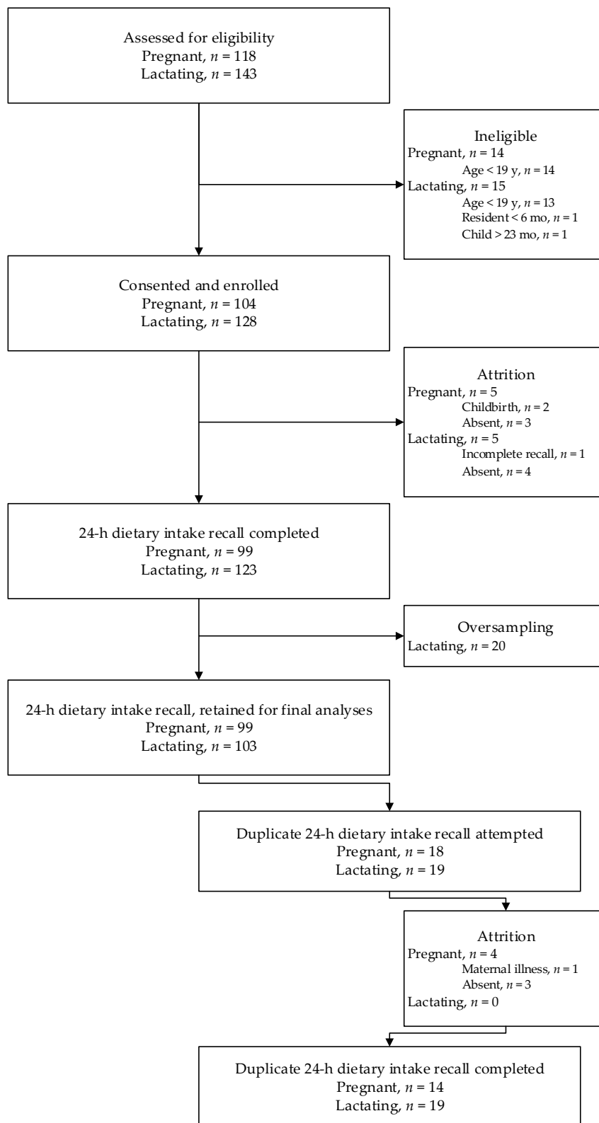
Figure 1. Flowchart of participant progression through the dietary intake assessment survey.