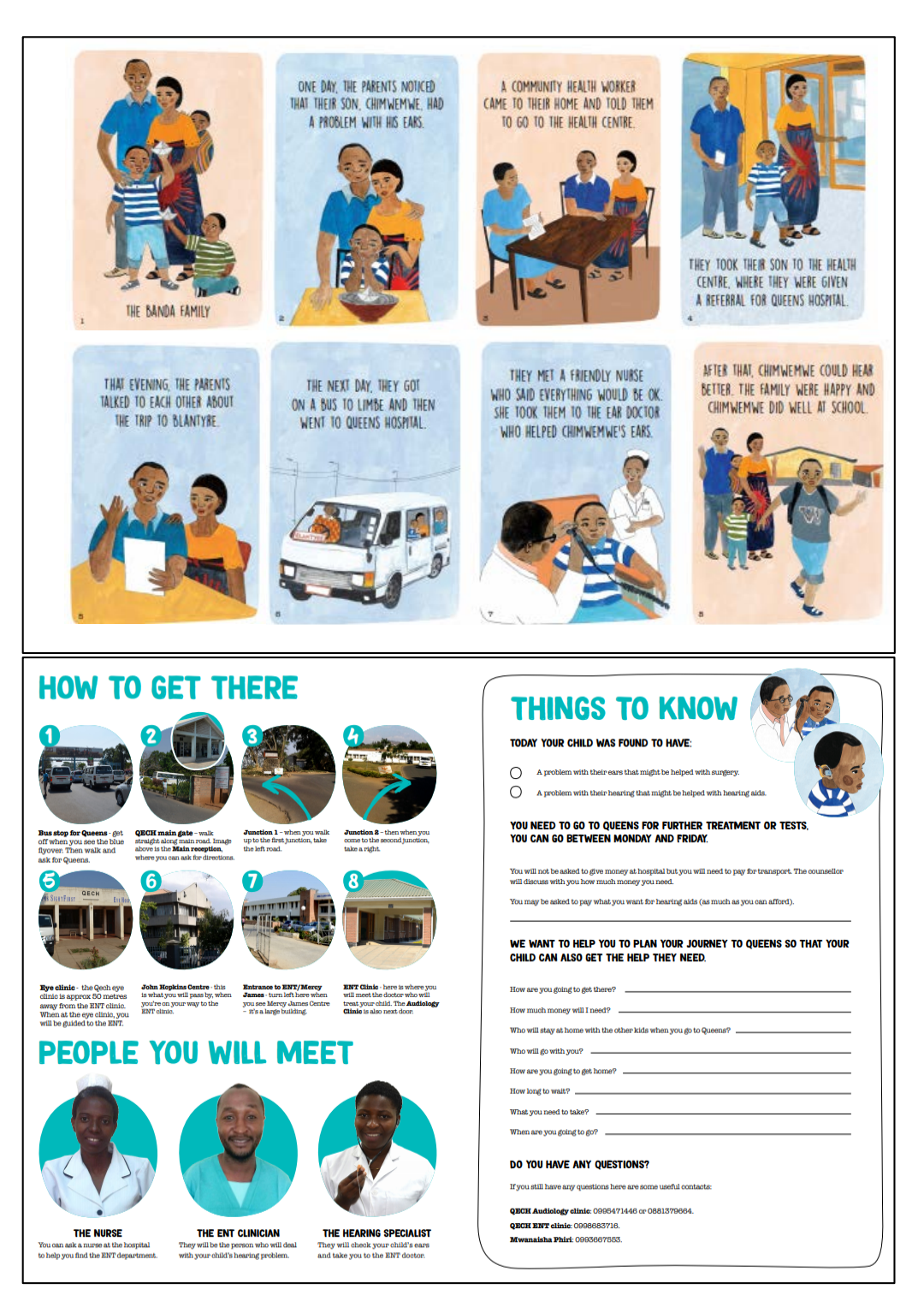
Figure 2. Final English version of the information booklet for Malawi intervention, before translation into Chichewa. The set of illustrated images at the top show the storyline, and the bottom shows further information about how to get to the hospital, the people that will be met, and a section on action planning (things to know) which was tailored to the individual family. The booklet was folded down to A6 format with page 1 of the booklet showing the first panel of the story (The Banda Family).