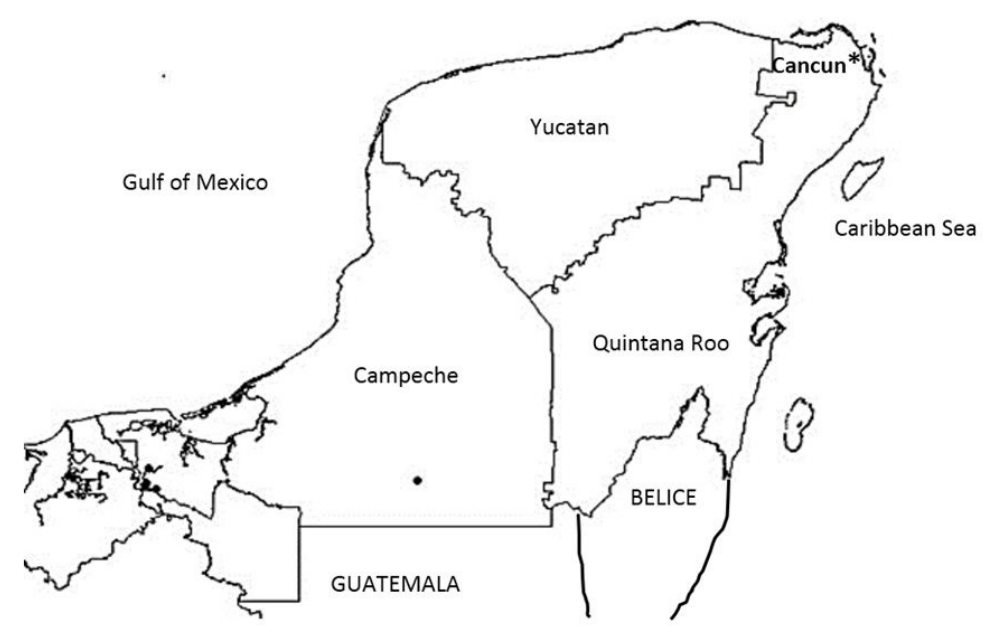
Figure 1: Geographical location of Cancun on the Yucatan Peninsula

The study was carried out in Quintana Roo state, it's located on the Yucatan Peninsula, bordering the state of Yucatan to the northwest, west state Campeche, Gulf of Mexico to the north and Belize and Guatemala to the south and east is washed by the water of the Caribbean Sea. A warm humid climate with a temperature range of 24-28 °C and a precipitation range of 0-1300 mm. It has a population of 1,325,578 inhabitants (National Institute of Statistics and Geography) (Figure 1).