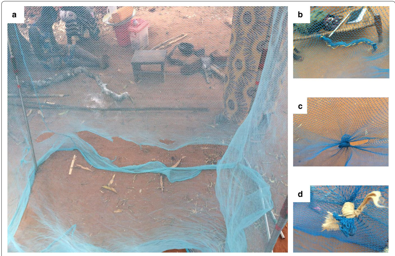
Fig. 3 Mosquito net assessment. a An illustration of the mosquito net assessment on a collapsible frame outside the household; b net repair by sewing; c partial net repair by tying a knot and d complete net repair by tying a knot

increased until nets were perceived to be "too torn" to be worth repairing.