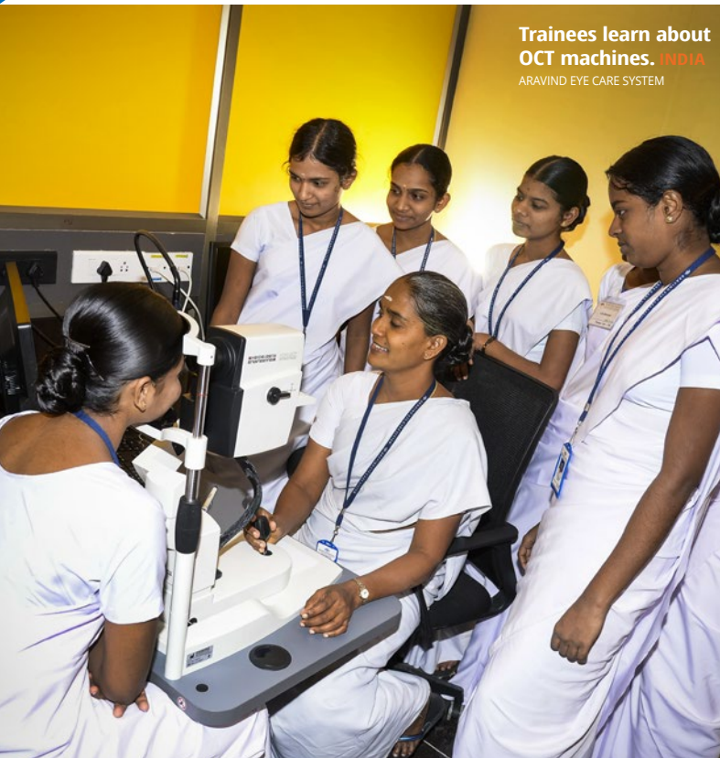
Trainees learn about OCT machines. INDIA ARAVIND EYE CARE SYSTEM