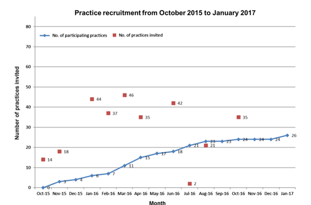
Fig. 2 COPE site recruitment