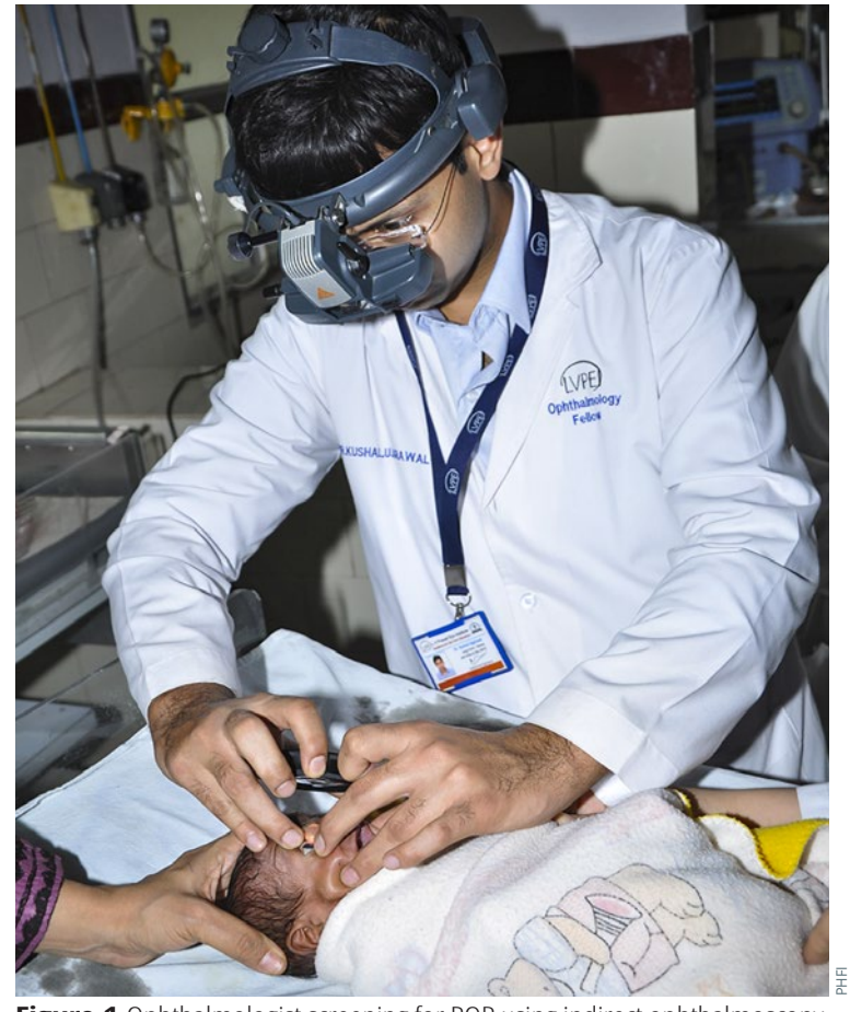
Figure 1 Ophthalmologist screening for ROP using indirect ophthalmoscopy

ophthalmologist must always be available to interpret the images.