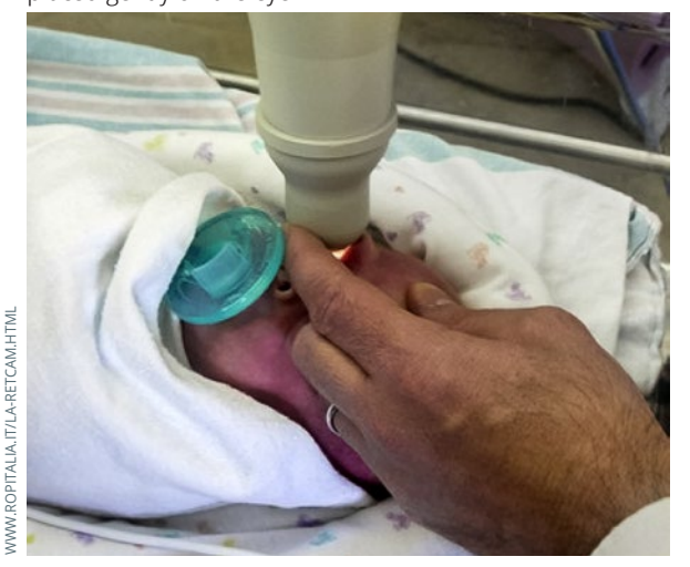
Figure 2 Screening using a RetCam, which uses a probe placed gently on the eye

Over the last few years, wide-field digital imaging systems, instead of indirect ophthalmoscopy, have also been used for screening. The retinal image can be captured by an ophthalmologist, a trained nurse, or a technician (Figure 2). However, an experienced