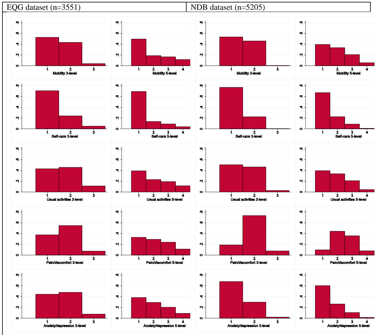
Figure 1: Response histograms for EQ-5D-3L and EQ-5D-5L in the EQG dataset and the NDB dataset