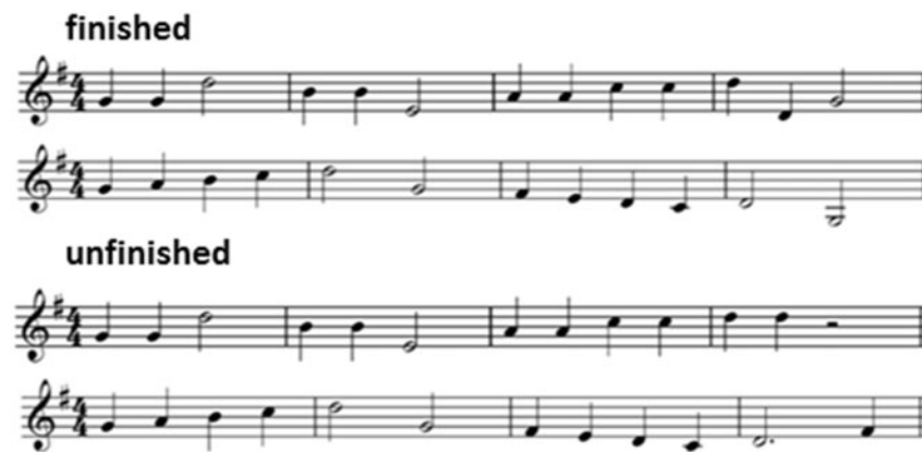
Fig. 1. Examples of stimuli used in the music experimental battery: 'finished' (tonally resolved) and 'unfinished' (tonally unresolved) melodies presented in the tonal (harmonic) expectancy test (see text for further details).

Abbreviated Scale of Intelligence (WASI) Matrices score, an index of overall disease severity] within the patient cohort.