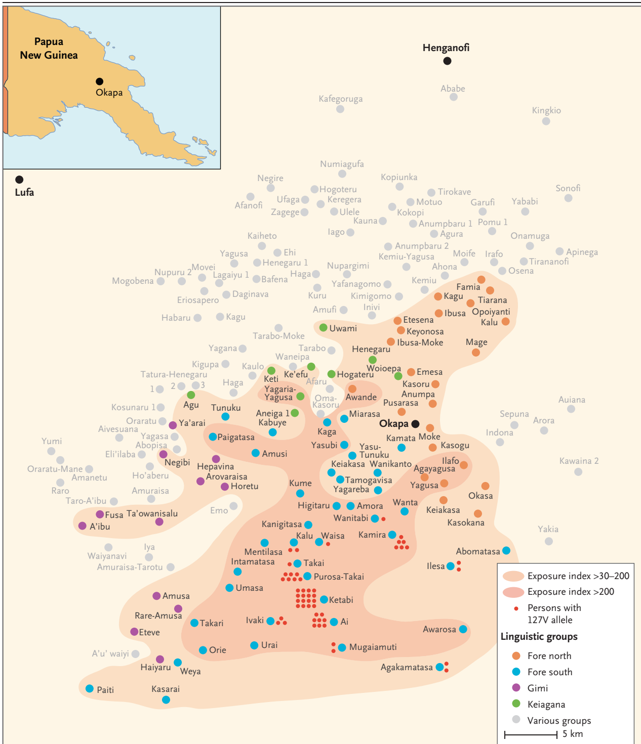
Figure 2. The Kuru-Exposed Region in Detail, Showing Areas of High Exposure and Persons with the 127V Allele.

We divided the kuru region into three zones of increasing exposure: villages with at least one recorded case of kuru but an exposure index of 30 or less (low-exposure group); a zone with an exposure index of more than 30 to 200; and a high-exposure zone, with an exposure index of more than 200. Red dots show the locations of persons with the 127V allele. The Purosa valley includes the villages of Purosa-Takai, Ketabi, Ai, and Mugaiamuti. The figure is adapted from a figure in Collinge et al., 26 which shows the location of all villages with a history of kuru.