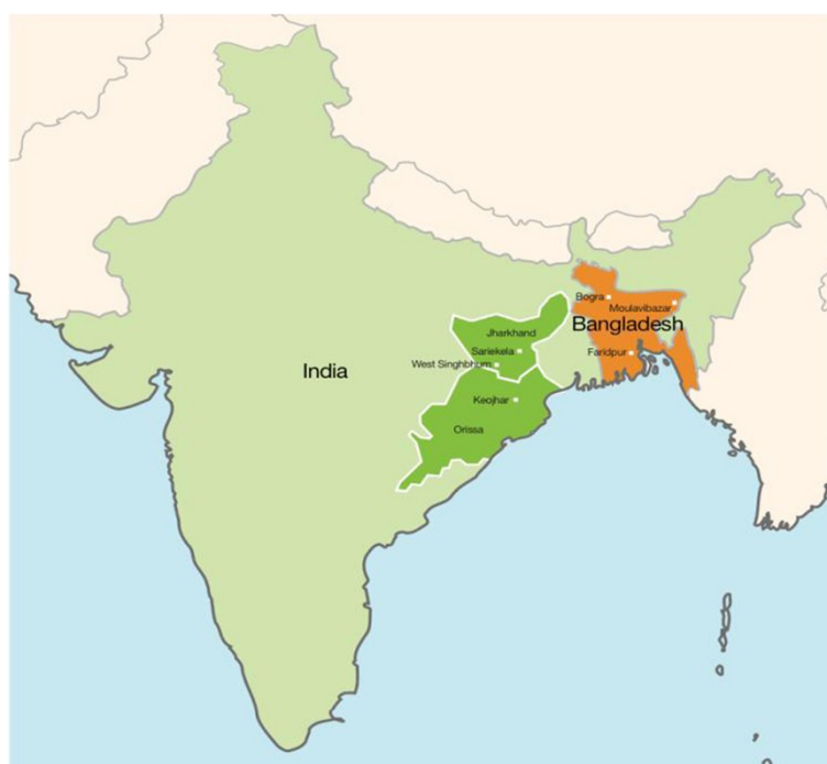
Figure 1 Map displaying the location of the different study sites.

fieldworker. Information about the individual surveillance systems can be found elsewhere [23-26].