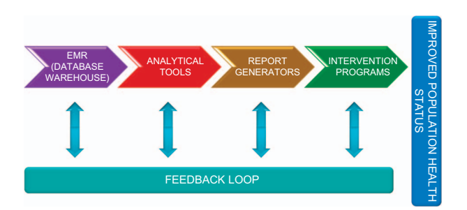
Figure 1. Process through which information can be used to improve health care.

Predictive modelling. Predictive modelling is a statistical process that uses regression analysis to identify patterns and predict the likelihood of future events such as hospitalization and risk of being high cost in the future (4,5). A comprehensive measure of morbidity burden