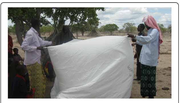
Figure 1 The Dumuria LLIN. A Dumuria net being displayed in the field.

PermaNet<sup>®</sup> Dumuria (hereafter referred to as a Dumuria net) is an LLIN produced by Vestergaard, Switzerland, intended for use both indoors and outdoors. This net is based on the PermaNet<sup>®</sup> 2.0 which is fully evaluated and recommended by the WHO Pesticide Evaluation Scheme (WHOPES) [17]; the only differences being unlike a typical 156 mesh LLIN this net is made of a non-mesh, opaque, bed sheet-like fabric (Figure 1) and added to the insecticide in the Dumuria net (and not found in the PermaNet<sup>®</sup> 2.0) are UV protectants designed to make the