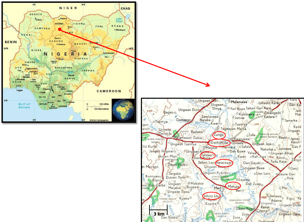
Figure 1 Map of Nigeria showing the site of the study in Katsina State, Nigeria, and a more detailed map of the study area indicating the area covered by the Malumfashi Endemic Diseases Research Project. Villages circled in red had more than 10 cases.