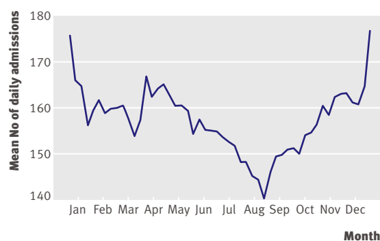
Fig 3 | Trends in overall weekly number of emergency admissions for myocardial infarction (average daily count) averaged across years

The second explanation for the more modest decline found in our study relates to differences in methods. Several of the earlier studies used a “before and after” study design, and, although some used geographical controls, they might have been unable to fully account for underlying trends in admissions for myocardial infarction. Given the marked decline observed in admissions from 2002 onwards in our data, consistent with similar declines observed elsewhere, 26-32 this might account for the greater reductions seen in such studies. Moreover, even if the before and after periods of these studies spanned the same months, bias from unseasonal weather patterns and fluctuations in the prevalence of other factors known to influence rates