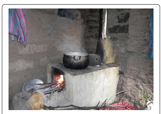
Figure 3 Locally constructed, improved cookstove installed in Peru.