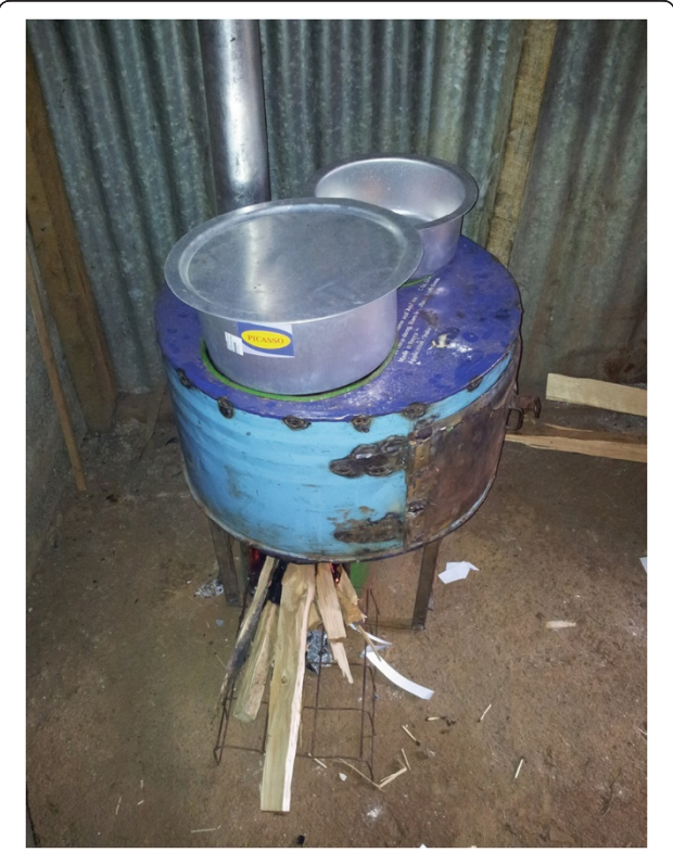
Figure 5 Locally constructed, improved cookstove installed in Kenya.

Kenya), Institute of Medicine at Tribhuvan University (Kathmandu, Nepal) and Lifespan/The Miriam Hospital (Providence, USA).