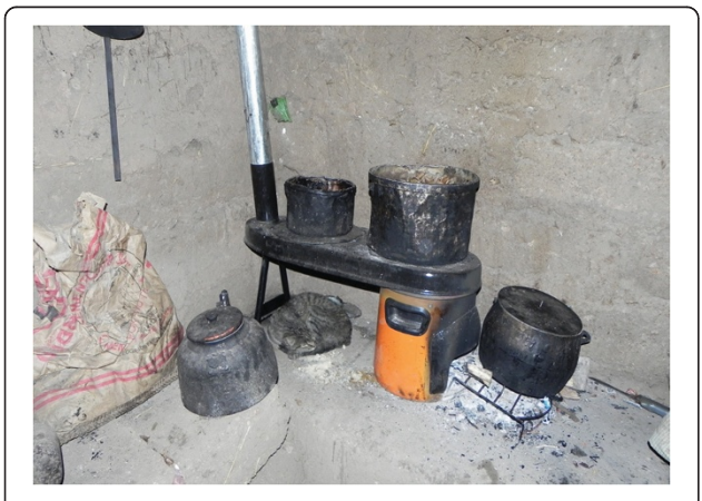
Figure 2 Envirofit G-3300/3355 installed in Peru.

The trial will be implemented at the United States National Heart, Lung and Blood Institutes and UnitedHealth Group Centers of Excellence in Chronic Diseases in Kenya (AS-ANTE Center of Excellence) and Peru (CRONICAS Center of Excellence) and at the Nepal Nutrition Intervention Project, Sarlahi (NNIPS) in Nepal. Partners include Johns Hopkins University in Baltimore, USA and Brown University in Providence, USA. All three field sites have local offices and staff that provide sufficient and culturally sensitive infrastructure for recruitment, intervention, data collection and data entry for the implementation of this project. This study was approved by the Institutional Review Boards of Universidad Peruana Cayetano Heredia (Lima, Peru), Johns Hopkins Bloomberg School of Public Health (Baltimore, USA), A.B. PRISMA (Lima, Peru), Moi University (Eldoret,