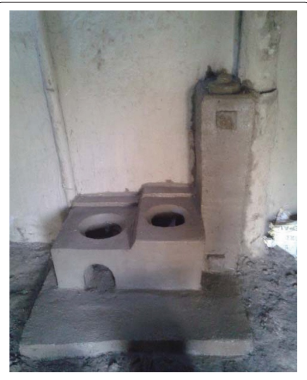
Figure 4 Locally constructed, improved cookstove installed in Nepal.