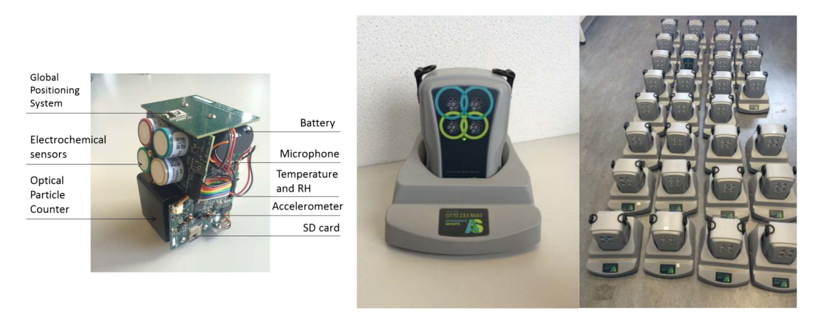
Figure 2 Design of the PAM platform internals, in charging base-station and 'en masse'. PAM, personal air monitor; RH, relative humidity; SD, secure digital.

In total, 160 participants will be recruited from CPRD using an algorithm containing validated COPD diagnostic codes. Patients with data in CPRD who have a diagnosis of COPD based on a validated code list by Quint et al <sup>21</sup> are not coded for mild COPD (ie, moderate or severe patients only), are not coded as a current smoker, are aged >35 years, and have had between one and two identified exacerbations in the preceding year will be included. After running the algorithm to identify suitable participants, general practices that have agreed to participate in research through CPRD will be sent a list of the potential participants. GPs will confirm to CPRD the suitable patients identified previously using the Vision Identification. CPRD will then send participant