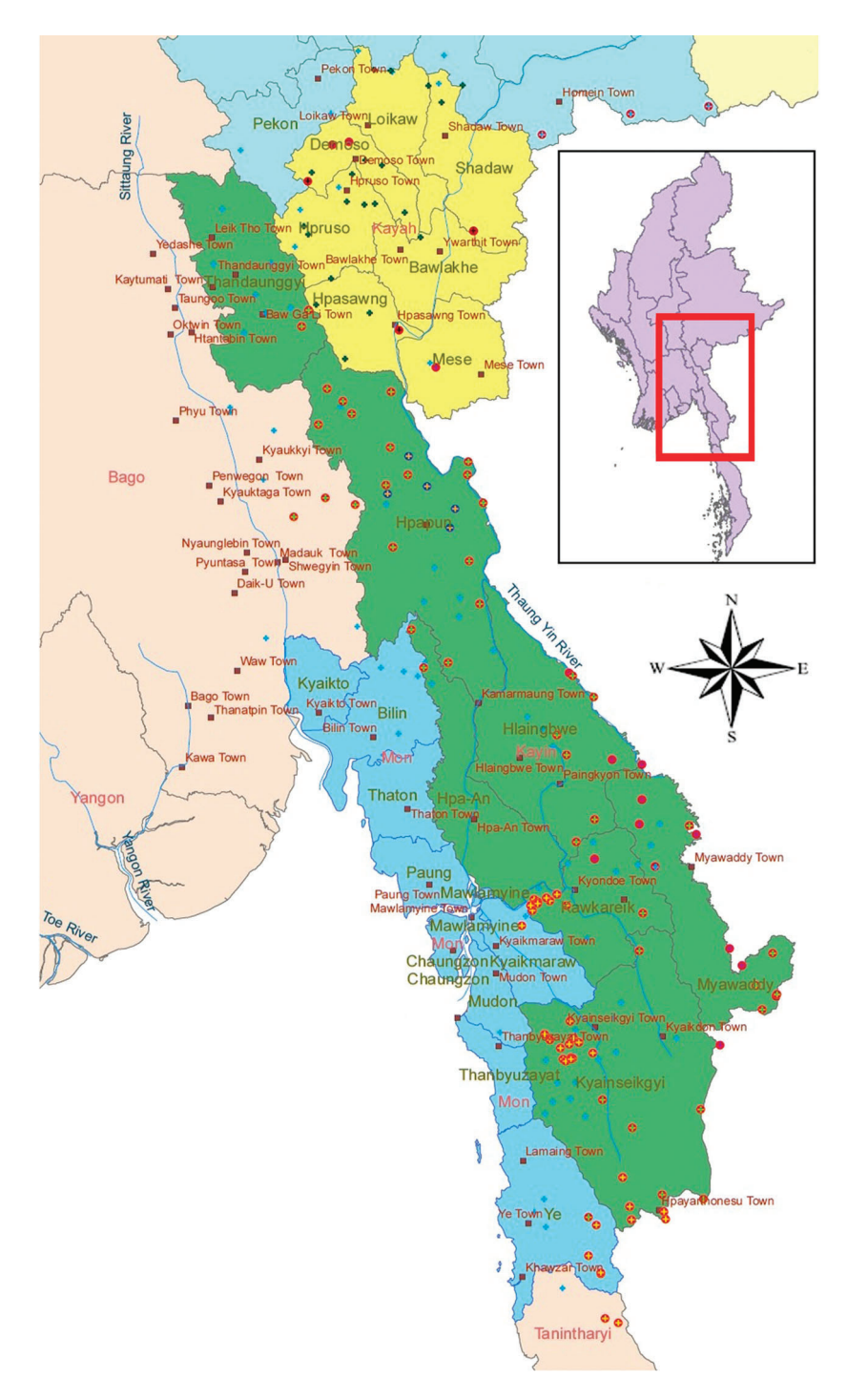
Fig. 2. Study area of ethnic townships.

which reflected the development of the HRH and were easily accessible. Ten informal context interviews were conducted with clinic-in-charges during their biannual meeting in Mae Sot. Interviews were facilitated by three health information system (HIS) staff. The initial draft of this article was forwarded for review and feedback by the five EHO and CBHO leaders who were integrally involved in the HRH development through policy, planning, or