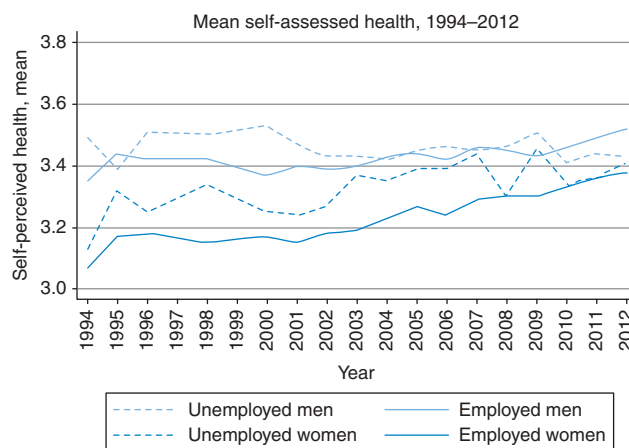
Fig. 2 Change in self-assessed health among unemployed and employed. The data for 1997 and 1999 are not available. The mean SAH among those unemployed seems to be higher compared with their employed counterparts, although in most periods the difference is not significant. This is most likely, because they are younger. After adjustment for individual- and household-level characteristics in the regression analyses, as shown in Table 2, 'being employed' status is a strong predictor of SAH.

Table 2 (part A) presents the results of the logistic regression of determinants of good SAH in the general population. Among males, good health was positively associated with age, being better educated, being employed, living in a larger household, a non-poor one and residing in a rural area. Among females, the pattern was similar, except that significantly better health began to be seen at lower poverty levels. When restricting the sample to those unemployed (Table 2, part B), among males, only living in a rural area and in a wealthier household were significantly associated with better health. Among females, age, residing in a rural area, living in a larger and wealthiest household were significant.