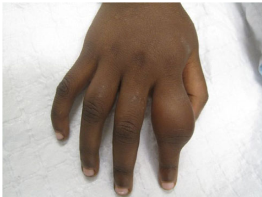
Fig. 4 Bony lesions of secondary yaws. Dactylitis due to secondary yaws.

ulceration. Goundou , which was rarely reported even when yaws was hyperendemic, is characterized by exostoses of the maxillary bones. 2