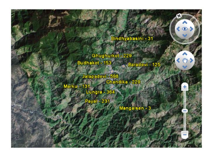
Figure 2. Screenshot of Nyaya Health mapping project. This particular image shows the number of patients from select surrounding villages over a six-month period. Using readily available GPS mapping information and data from our electronic patient database, we can map out service utilization and access to medical care. This helps in planning the geographic aspects of our community health programs. doi:10.1371/journal.pmed.1000158.g002

Finally, publicly available line-by-line budgets can play a critical role in improving the financial aspects of global health delivery [20]. The raw inputs to these expenditure displays are entries from the local accounting system, which includes everything from major purchases like generators and oxygen concentrators to small items like food for staff meetings. These data are presented through standardized online spreadsheets that allow donors, collaborators, and staff to easily access financial information (Figure 3). These data also help other practitioners to plan health delivery by seeing the breakdown in our expenditures alongside data