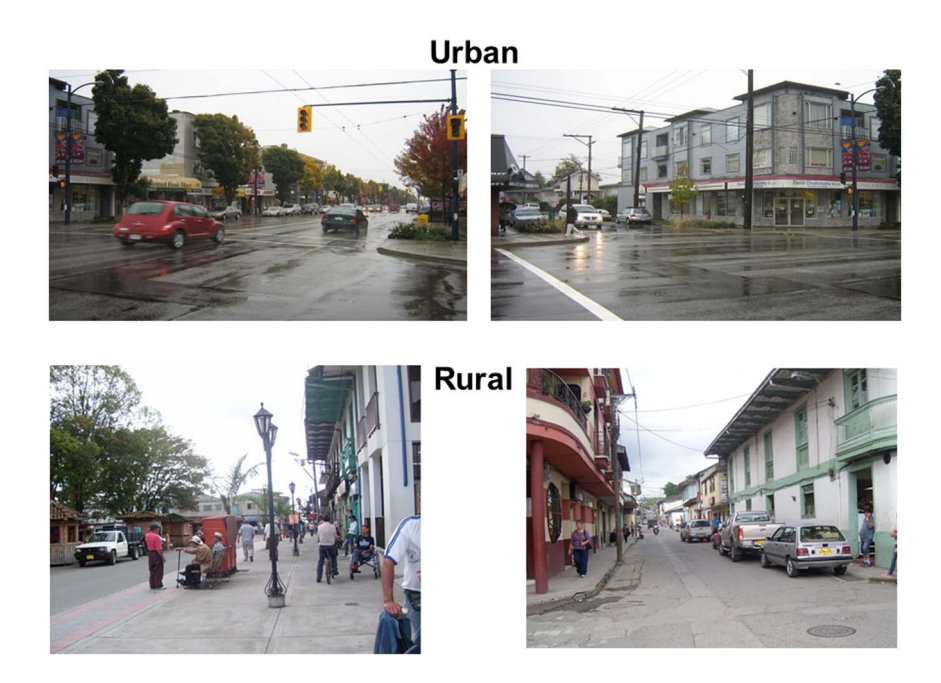
Figure 2. Examples of high scoring communities. In these communities from urban Canada and rural Colombia the common high-scoring characteristics are complete sidewalks, several planted trees, traffic signals, and pedestrian traffic signs, well maintained buildings and roads and the presence of street furniture such as benches and street lamps. doi:10.1371/journal.pone.0110042.g002

teristics observed were higher in the urban compared to the rural communities of Canada and there were relatively fewer pedestrian facilities in communities in India, which matches with expectations of individuals (many of the authors of this paper) that have travelled and observed both settings. While higher pedestrian and safety characteristics have been related to increased physical activity, [19] it is hard to ascertain whether the higher pedestrian facility and safety characteristics in Canada compared to other countries is more a function of the construct used to gain an objective measure of these characteristics being derived in countries with similar built environments such as the United States, Canada and Australia. [20] [21] It will require further investigation as to whether similar constructs about the built environment relate to physical activity in diverse countries. Similarly the higher measure of 'overall appeal' in Canada may be due to this measure being dominated by characteristics considered to be appealing in countries more similar to Canada or the assessment through a 'westernised' lens. The utility of the