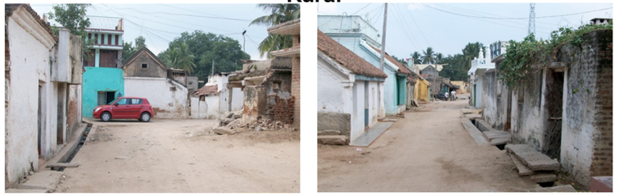
Figure 3. Examples of low-scoring communities. These are pictures of 2 low scoring communities overall. You can see in communities from urban Canada and rural India there is partial or no sidewalks, not many crosswalks, not many planted trees or aesthetically pleasing features. In addition the buildings are not well maintained. doi:10.1371/journal.pone.0110042.q003

overall appeal measures also need to be examined in analyses of predictive validity. Our analyses here did find that some variables requiring the observer to express an opinion had high reliability. However in the case of judgments about suitability for biking there were specific inter-observer differences reflecting their own experiences. Our findings with respect to the three items with low ICCs described at the end of the results, has led us to remove the first and third of these and to clarify the definition for the second.