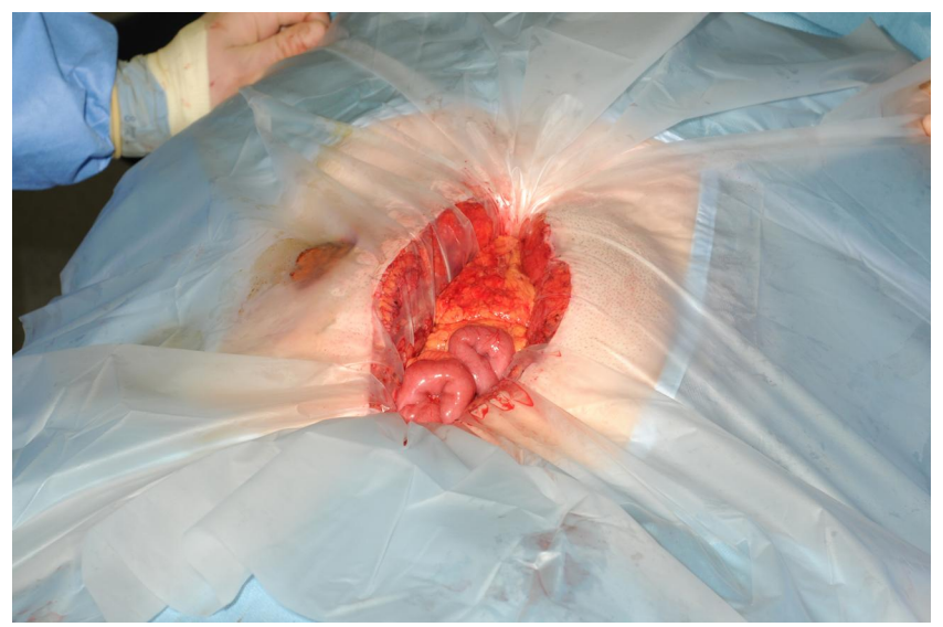
Fig 1 Wound edge protection device being used during surgery via midline laparotomy incision