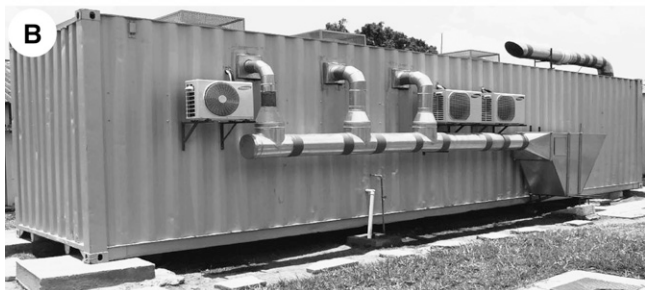
FIGURE 4. The Bill and Melinda Gates Foundation supported the BSL3 laboratory in Livingstone, Zambia. With many of the features highlighted in the molecular laboratory, the BSL3 laboratory also contains HEPA-filtered tissue culture hoods (A). Air flow is tightly controlled by an air filtration system, the majority of which is mounted outside, on the rear of the container (B).