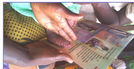
Figure 1 Using the counselling card to categorise newborn foot length as “very short” (<7 cm), “short” (7–7.9 cm) or “not short” (8 + cm) in Mtwara Region, Tanzania (here showing a newborn with “not short” foot length).

This was a cross sectional study of paired observations of newborn foot length, using the laminated counselling card, with one observation in each pair being done by a project researcher and the second by the community volunteers. In addition, the researcher and volunteers also measured foot length using a plastic ruler. Based on previous research [12] 50% of newborns were expected to have a foot length shorter than 8 cm (a proxy for birth weight less than or more than 2500 g). 143 observation pairs would be sufficient to estimate an expected kappa of 0.4 and its 95% confidence interval (indicating fair agreement between different observers using the same measurement tool) for rating newborns as having feet shorter or longer than 8 cm.